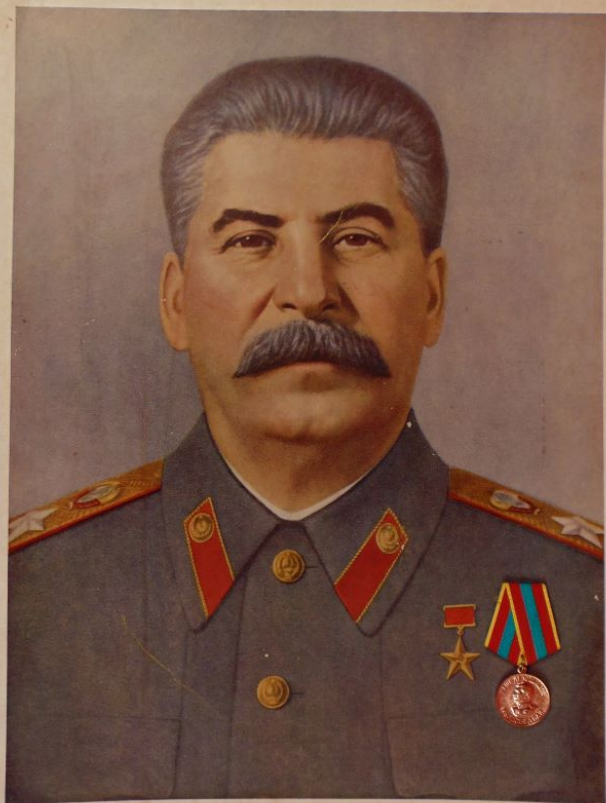
И. В. СТАЛИН