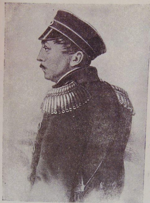
АДМИРАЛ ПАВЕЛ СТЕПАНОВИЧ НАХИМОВ