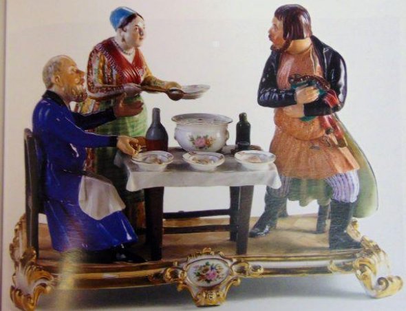
RARE AND FINE PORCELAIN GROUP: "DEMYANOVA UKHA", IMPERIAL PORCELAIN FACTORY, SAINT-PETERSBURG