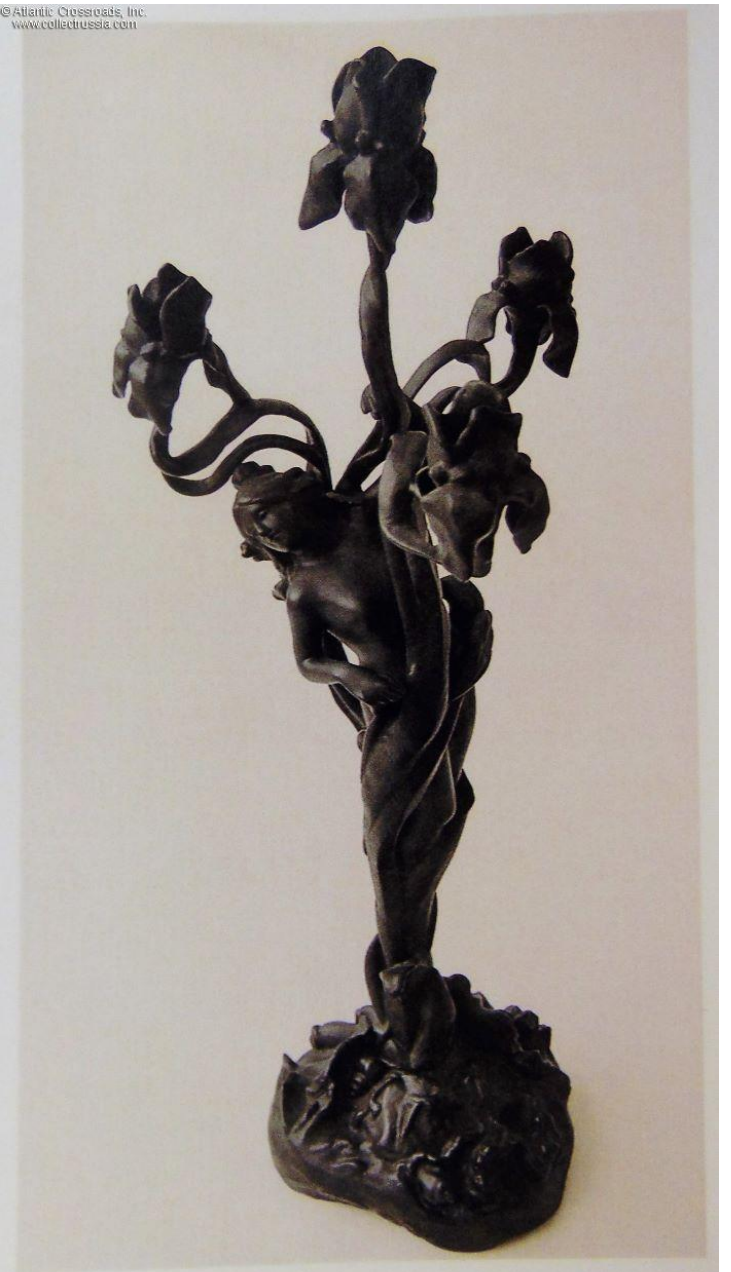
40. Канделябр «Водяная лилия» Автор М. Л. Диллон. 1899

Клейма: «Подергин» (на сторонах постамента в прямоугольной рамке), там же и с барбанти