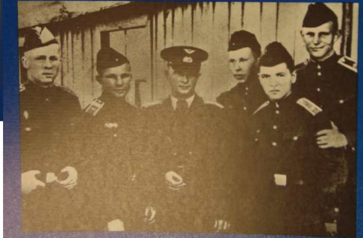
Ю.Гагарин среди курсантов военного училища