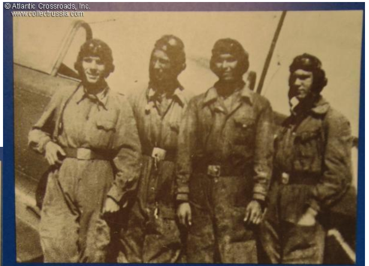
Ю.Гагарин с друзьями-курсантами аэроклуба на тренировочных полетах