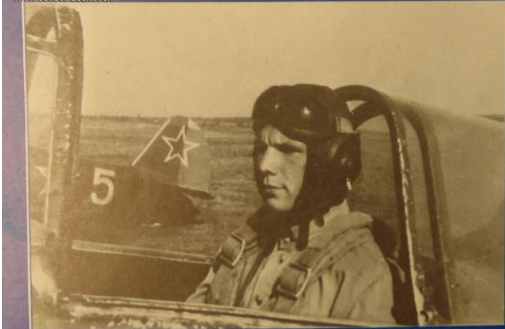
Отличные показатели у курсанта аэроклуба Ю.Гагарина