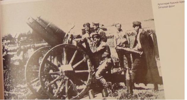
Артиллерия Красной Армии Западный фронт