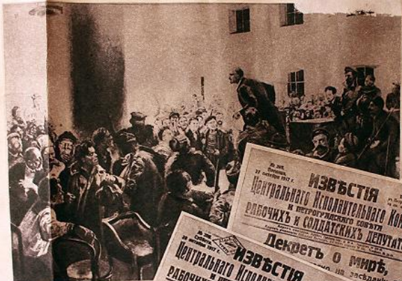
Выступление В. И. Ленина на II Всероссийском съезде Советов, Октябрь 1917 г. (С картины худ. Серебряного)