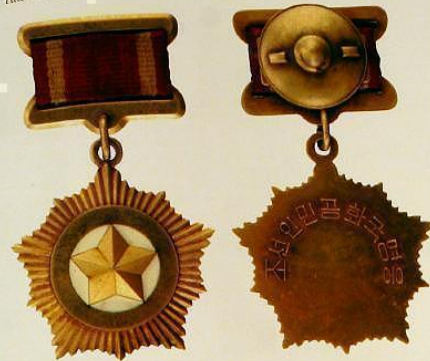
Hero of the DPRK, Type 1, Variation 1

Title "Hero of the Democratic People's Republic of Korea" and the Gold Star Medal