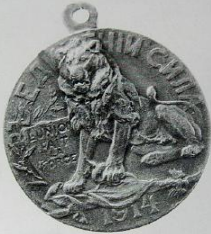
O. Die similar to 1581.1 but smaller and s line inscription in Russian БЛАГОРОДН Heroic