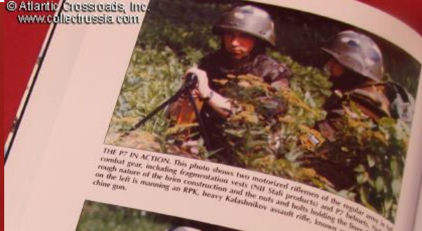
THE P7 IN ACTION. This photo shows two motorized riflemen of the regular army in full combat gear, including fragmentation vests (NIJ Stal products) and P7 helmets, in the rough nature of the terrain construction and the rub and bobs holding the rifle. The soldier on the left is manning an RPK, heavy Kalashnikov assault rifle, known as a hand-held machine gun.

The Soviet armed forces continued to paint their helmets with an updated form of nitrokraska of the kind of olive-green shade known in the west as olive-drab. However, as with earlier models, color standardization was never achieved until the new SSH-60 and SSH-68 appeared. SSH-40 colors ranged from forest-green to true olive-drab. It really depended on what paint lot was available. Helms produced at tank factories often got whatever shade of green was being sprayed on the tanks, also very rarely standardized. Throughout the Cold War, no outside decoration (marmes) was applied to army helmets. Those of the naval infantry (marines) used either a red star outline or a solid red star level. Some Soviet helmets (including the Polish wz. 50 used in limited quantities) were decorated by the Russian letters C and D, which were stenciled on, also at the