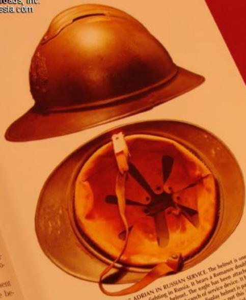
FRENCH MODEL 1917 ADRIAN IN RUSSIAN SERVICE. The helmet is one allocated to the Imperial Russian army forces fighting in Russia. It bears a Russian double-headed eagle in the front, painted olive just as is the helmet. The eagle has been attached through the two holes punched in the helmet for the French branch of service device. It has the original seven finger leather French one-piece liner. This museum display helmet is painted in what the Russians term "olive" color. It is not entirely clear whether or not this is a museum repaint to put it in conformity with the seemingly often ignored Russian paint specification.

first major w to approx t in the east parfare of the ern war took ary brigades ourg agreed to ch helmet. Rus successful allied The decision to ally produced for and fatally frag measure until a do ared. French government y free of charge be or Russia to remain a bers of enemy troops sh supplied with a Ro nt, attached through the without effect, asked for to fight on the more ag brigades that were French mili and