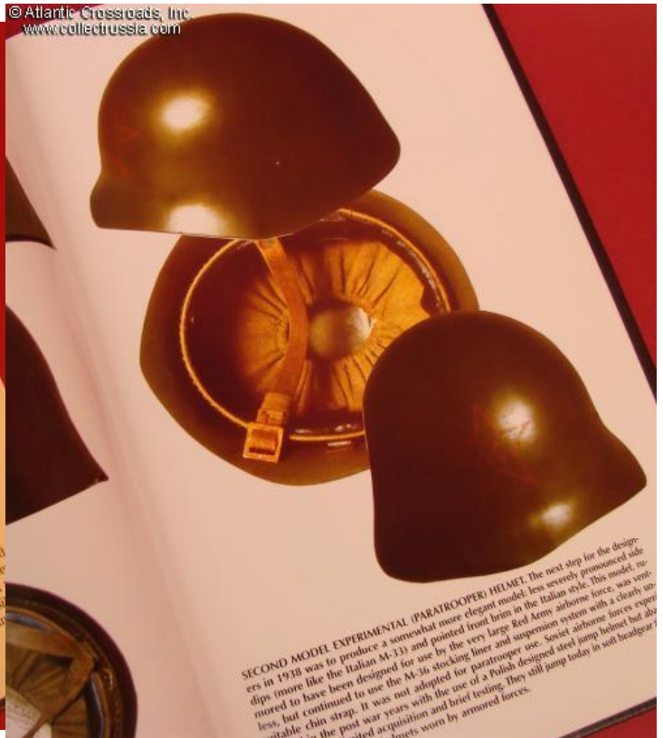
SECOND MODEL-EXPERIMENTAL (PARATROOPER) HELMET. The next step for the designers in 1938 was to produce a somewhat more elegant model, less severely pronounced side dips (more like the Italian M-33) and pointed front brim in the Italian style. This model, rumored to have been designed for use by the very large Red Army airborne force, was vented, but continued to use the M-36 stocking liner and suspension system with a clearly unsuitable chin strap. It was not adopted for paratrooper use. Soviet airborne forces experimented in the post war years with the use of a Polish designed steel jump helmet but also used limited acquisition and brief testing. They still pump today in soft headgear.

painted a tan-olive as illustrated. Of those defending the homeland Russian Imperial Guards forces were the first to be issued the helmets. The helmets became first known to the enemy when Austro-Hungarian troops faced General Aleksey Brusilov's breakthroughs on the southwestern front in the summer of 1915.