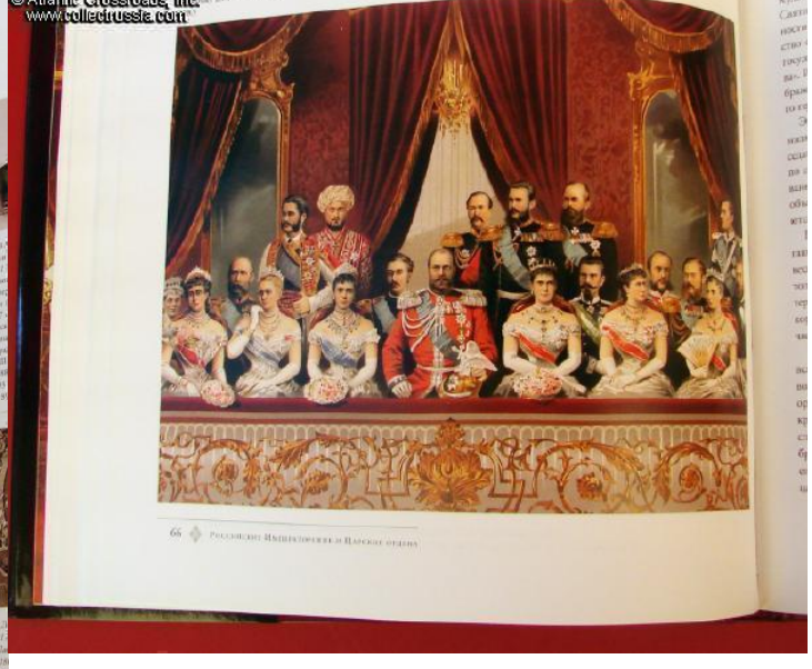
66 ПАСОДНИКЪ ИМПЕРАТОРА И ЦАРИЦЫ ПАСОДНИКЪ ИМПЕРАТОРА И ЦАРИЦЫ