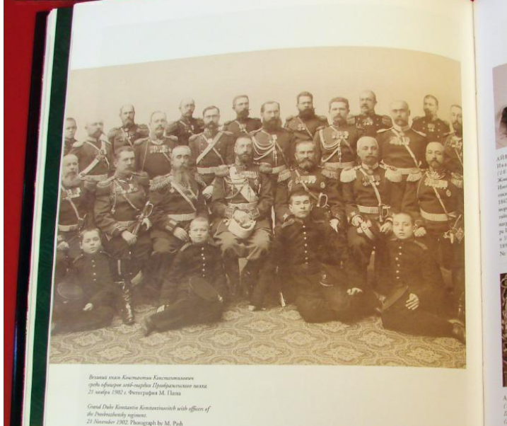
Великий князь Константин Константинович с офицерами штаба-квартиры Прибалтийского фронта 21 ноября 1902 г. Grand Duke Konstantin Konstantinovich with officers of the Headquarters of the Baltic Front 21 November 1902.