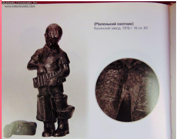
(Маленький охотник) Кусинский завод. 1976 г. 16 см. R3