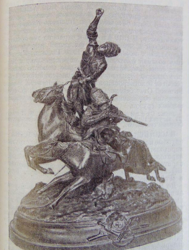
Е. А. Лансере. «Джигитовка». Каслинский завол. Из собрания Свердловской картинной галлереи.

озёрах. КАСЛИНСКОЕ ХУДОЖЕСТВЕННОЕ ЧУГУННОЕ ЛИТЬЁ— старинная отрасль русской художественной пром-сти, производящая из чугуна архитектурные украшения, скульптуру, садовые стольки, скамейки, стулья, вазы, решётки и различные бытовые предметы с рельефами и ажурным орнаментом. Изделия К. х. ч. л., производство к-рых сосрелоточивалось на Каслинском чугунолитейном заволе (Челябинская обл.), основанном в 1747, всегда