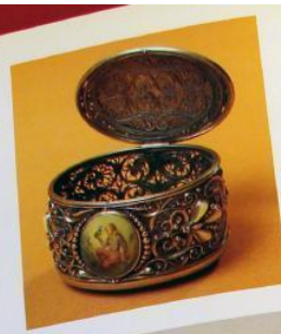
176 Fedoskino lacquerware with ornamental painting