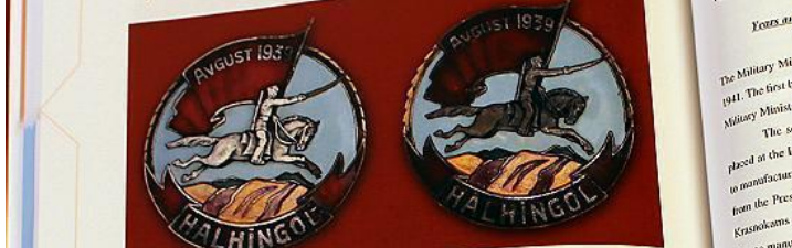
variation 1, Sub-Variation 1, Medal for the Battle at Khalkhin Gol on the left and Variation 1, Sub-Variation 2 on the right. Note the different gold-plated edges of both specimens.