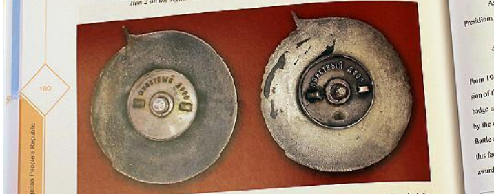
The reverses of the same two Medals for the Battle at Khalkhin Gol. The Sub-Variation 1 medal on the left and the Sub-Variation 2 medal on the right. Note the differently shaped edges of both specimens.